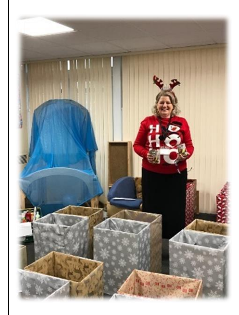
Impact – Vulnerable families were supported to have a family Christmas.

At our Family and Wellbeing Centres across the county we provided food parcels for Christmas for our vulnerable families. Much of the food was donated but the parcels needed to be put together. I enjoyed a morning at one of our centres, helping sort out all the parcels with members of staff and volunteers at one of our centres.