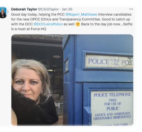
Impact – To ensure the public can clearly see the work of the PCC and the Police and Crime Panel.