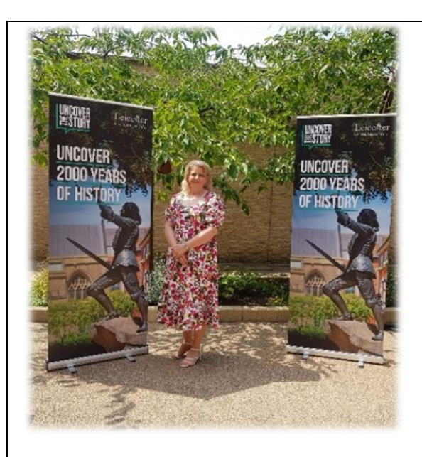
Impact – Raising awareness of tourism in the county; Partnership working with Leicester City Council.